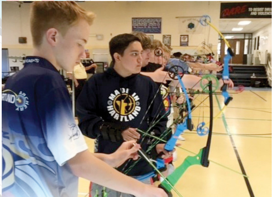
The Hartland NASP Champions practice hard for their place on the team as you can see by their concentration while on the shooting line!