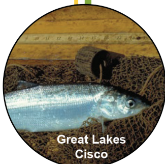
Great Lakes Cisco