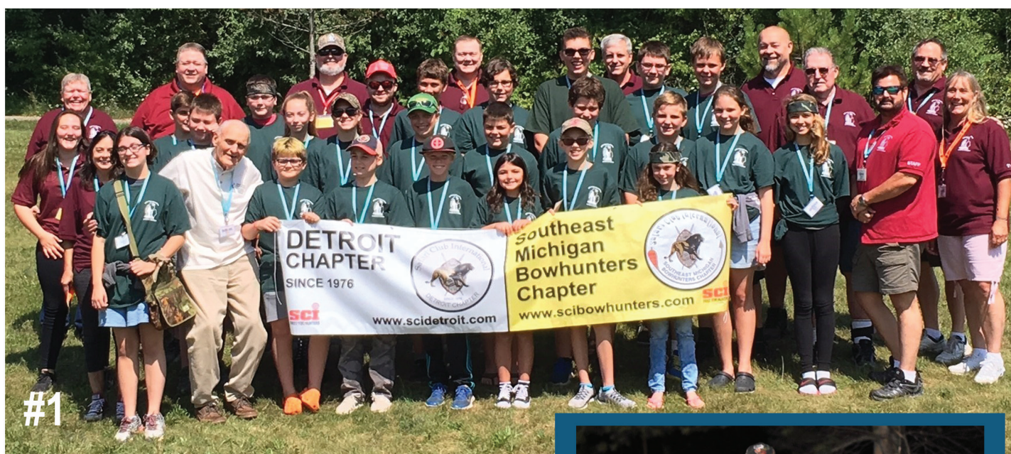
SHAP Camp • 8/2018

Safari Club International - Southeast Michigan Bowhunters