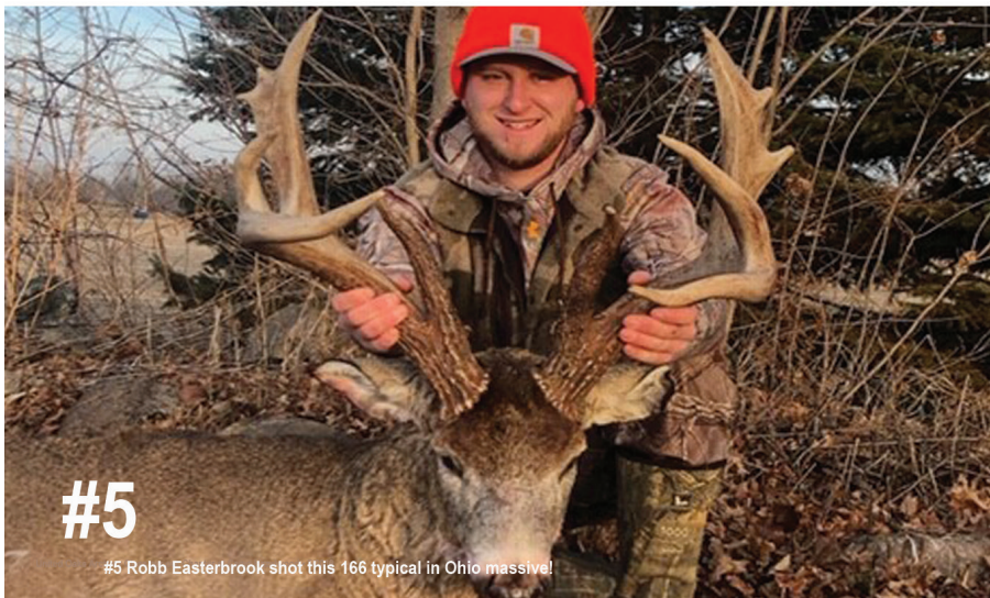
#5 Robb Easterbrook shot this 166 typical in Ohio massive!