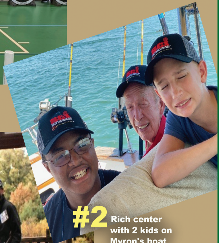
#2 Rich center with 2 kids on Myron's boat