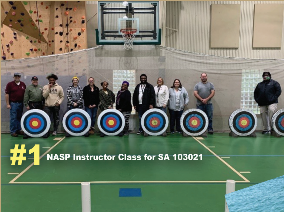
#1 NASP Instructor Class for SA 103021