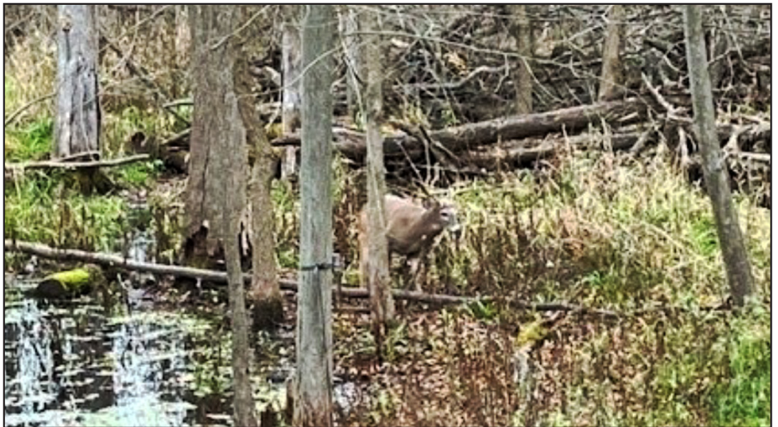
My buck from the West

At 6pm I climbed out of Jeff's blind and headed in the direction I saw last saw him. On the way there, I watched the ground for signs of blood or hair. I looked back at the blind to check my distance and when I looked down, I saw hair. Looking around I saw a deer trail headed NE towards the big swamp and started following it for about 20-25 yards and didn't see any blood so, I went back to my last sign and followed another trail to the NW. After twenty yards with no sign I headed back to the deer hair and started looking and finally found a spot of blood heading North. After a few yards I found more blood and kept following the blood trail which kept getting bigger as I went. Finally, I saw his white belly fifteen yards ahead to my left. I went to him and quietly took it all in and realized