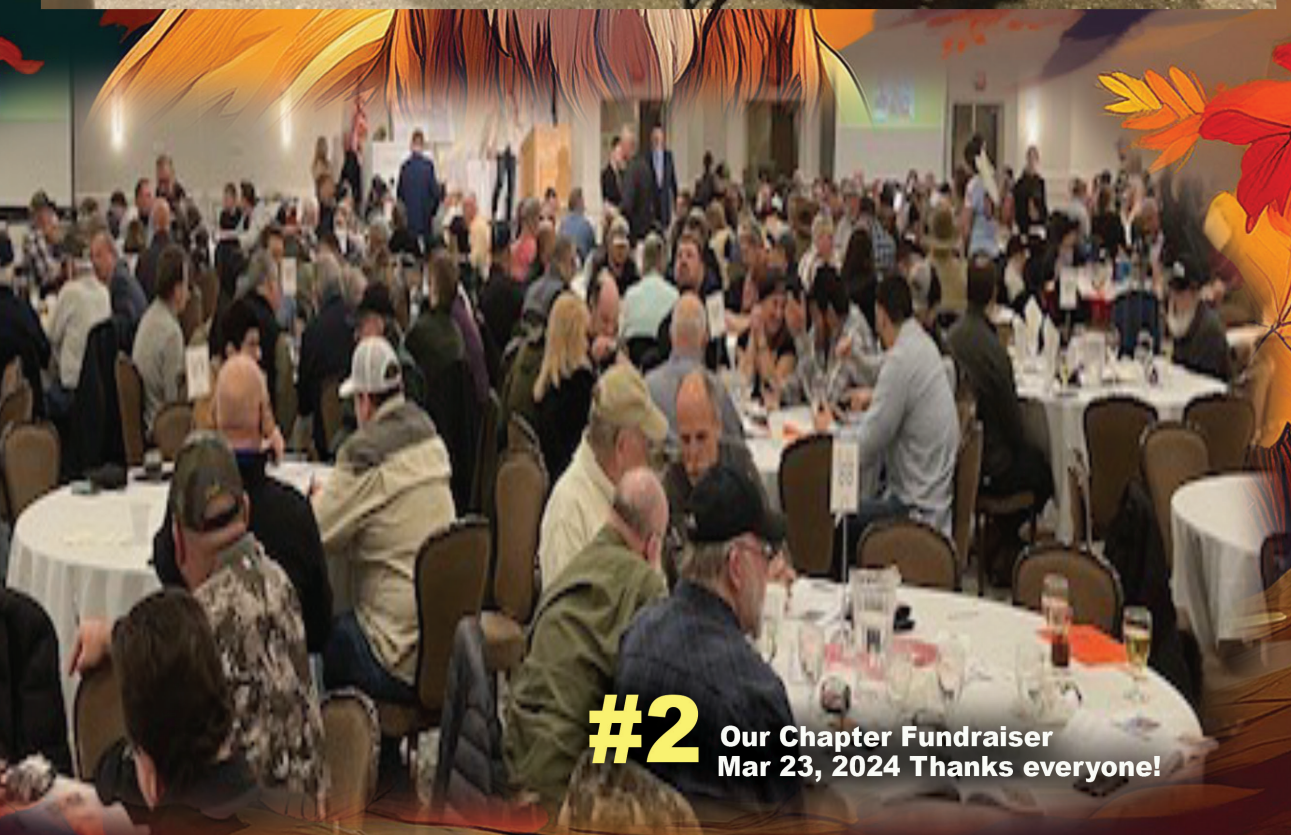
#2 Our Chapter Fundraiser Mar 23, 2024 Thanks everyone!