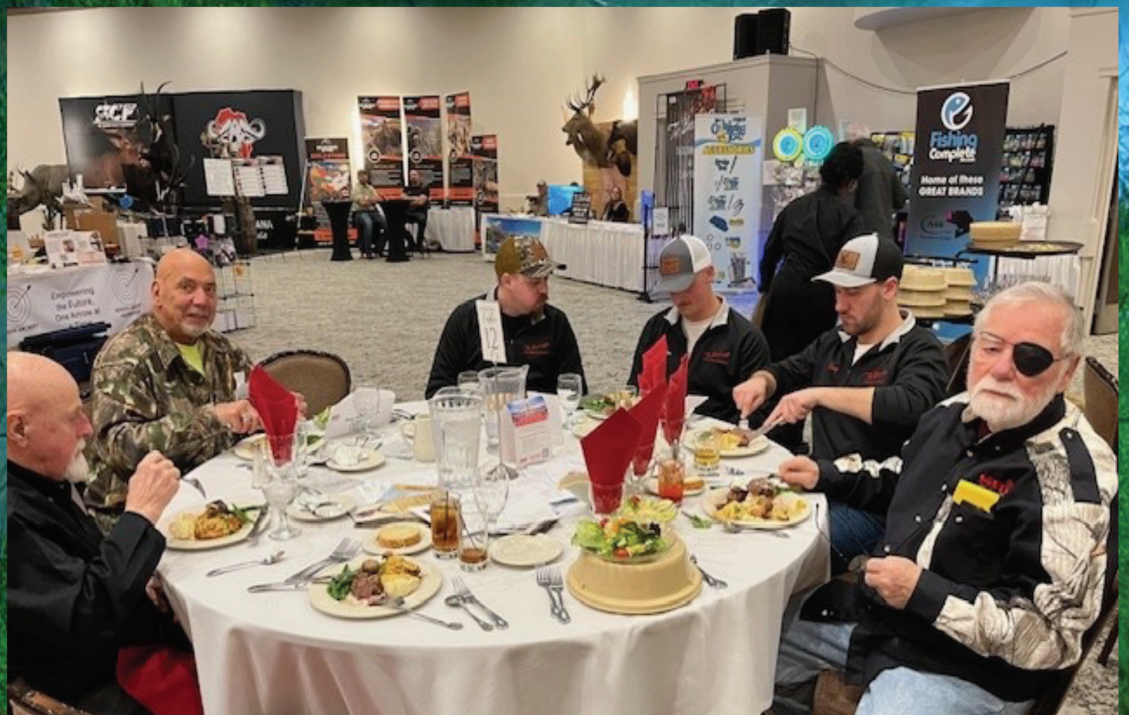
Outfitter and Chapter members enjoy our FR meal 2025