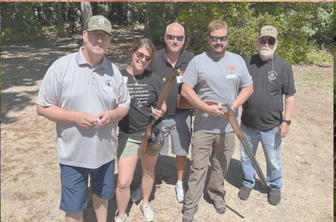
Our Chapter Team at Salvation Army Sporting Clays