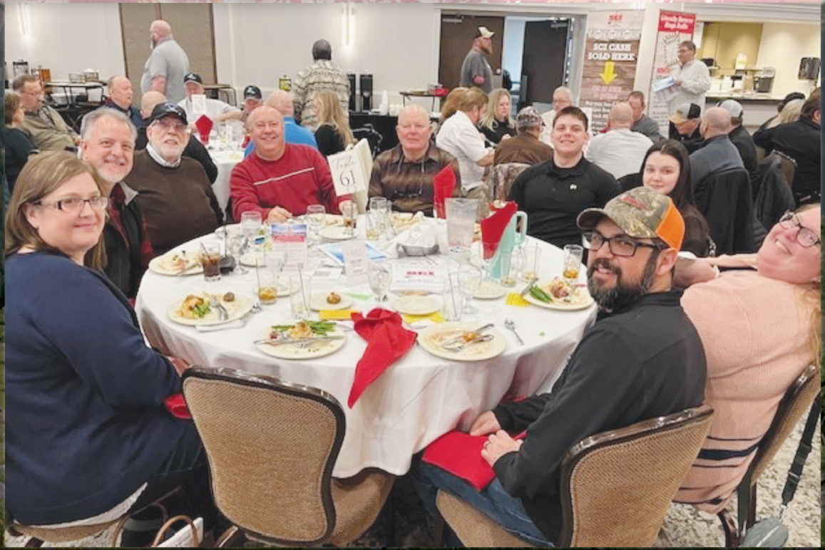
Our Salvation Army supporters Fundraiser 2026